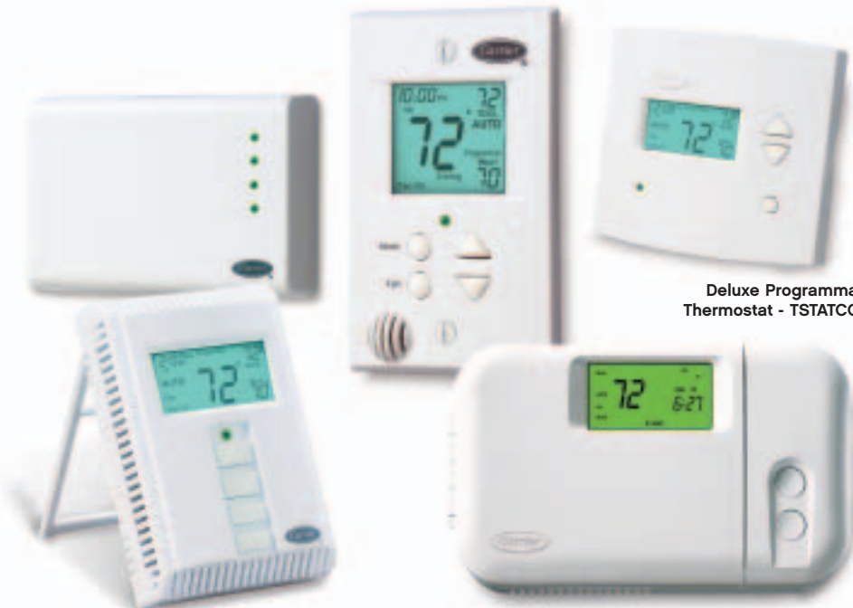
Deluxe Programmable Thermostat - TSTATCCPS701